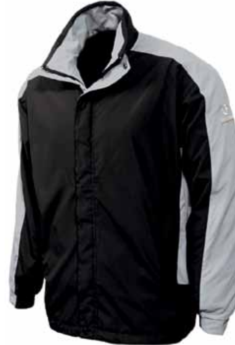
BLACK / LIGHT GREY