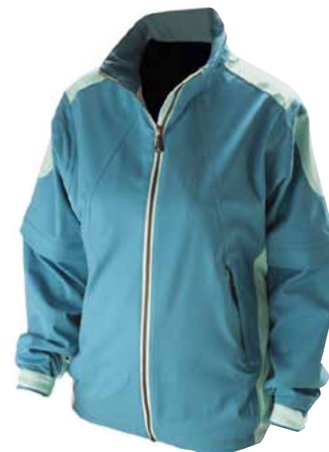
MERMAID / LIGHT TURQUOISE