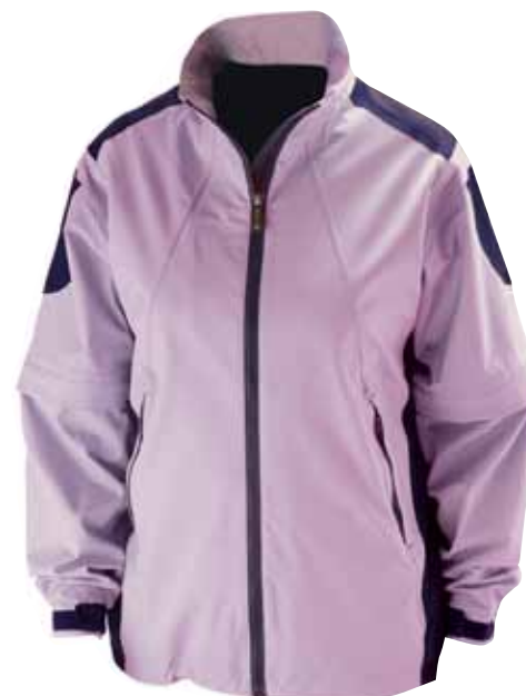
LILAC / PURPLE