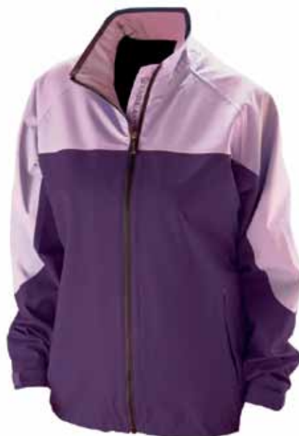
PURPLE / LILAC