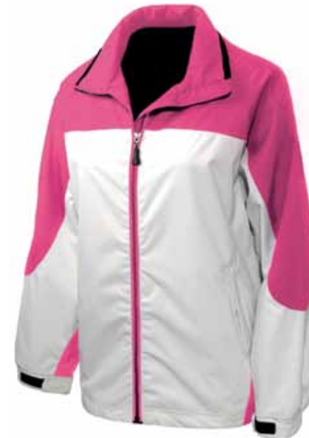
WHITE / CERISE / BLACK