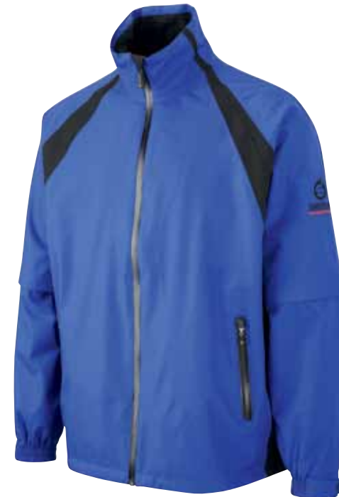
ROYAL / BLACK