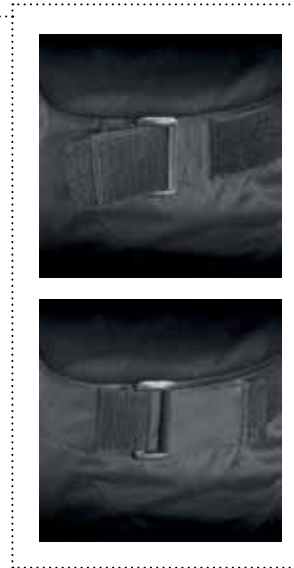
SIDE VELCRO ADJUSTERS