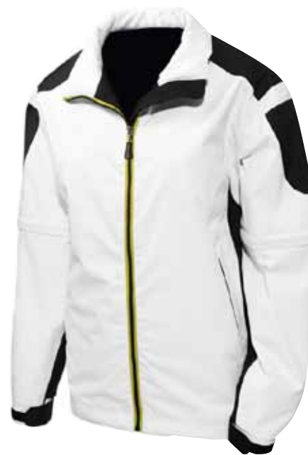
WHITE / BLACK / GREEN