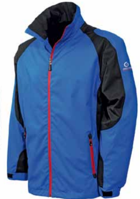
ROYAL BLUE / BLACK