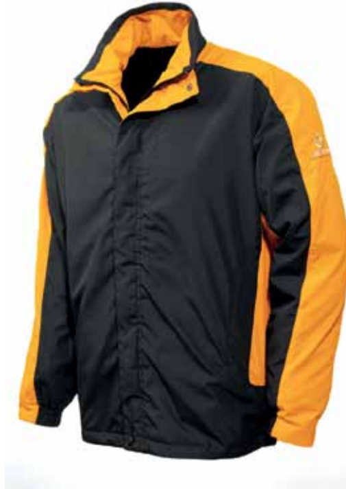
BLACK / ORANGE