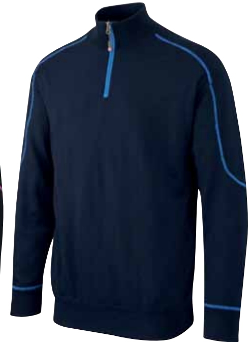
NAVY / ROYAL/SILVER