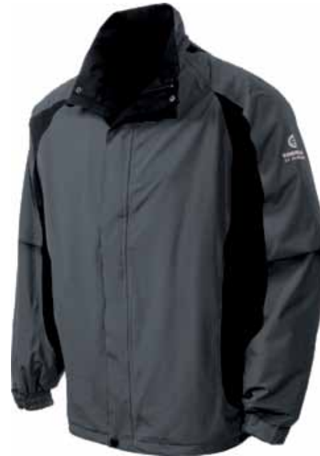
CHARCOAL / BLACK

Charcoal / black jacket converts to half sleeve