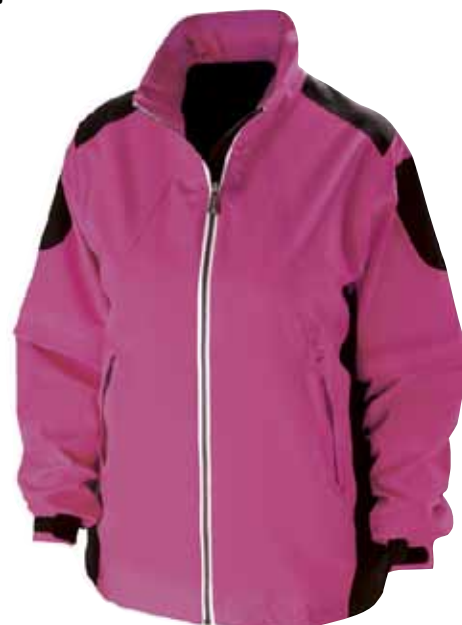
CERISE / BLACK / WHITE