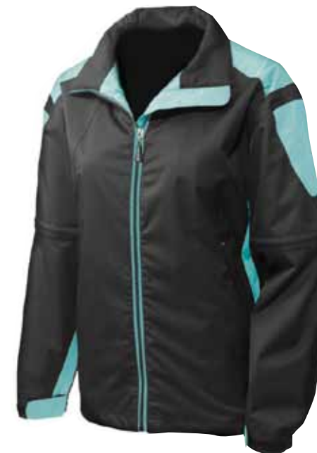
BLACK / AQUA