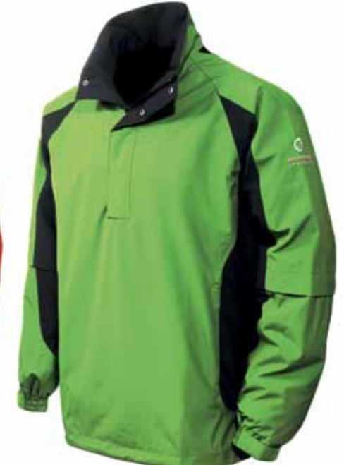
GRASSHOPPER / BLACK