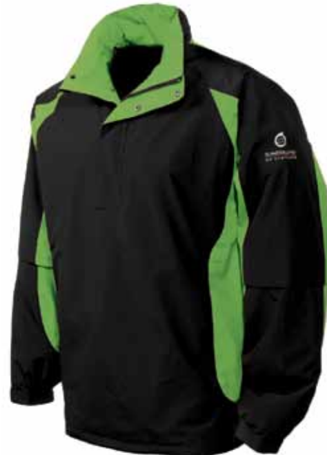
BLACK / GRASSHOPPER