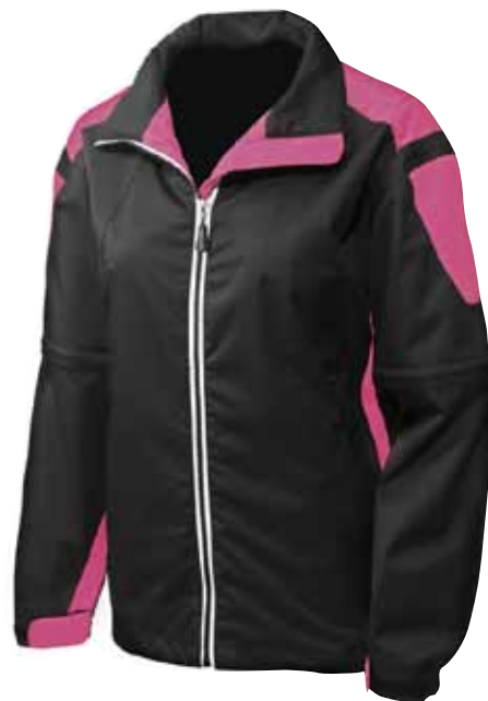
BLACK / CERISE / WHITE