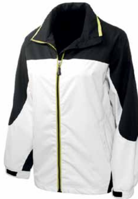
WHITE / BLACK / GREEN