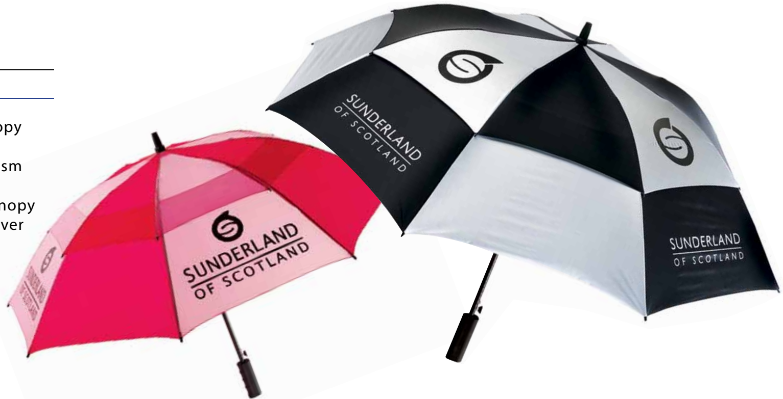
CERISE / PINK