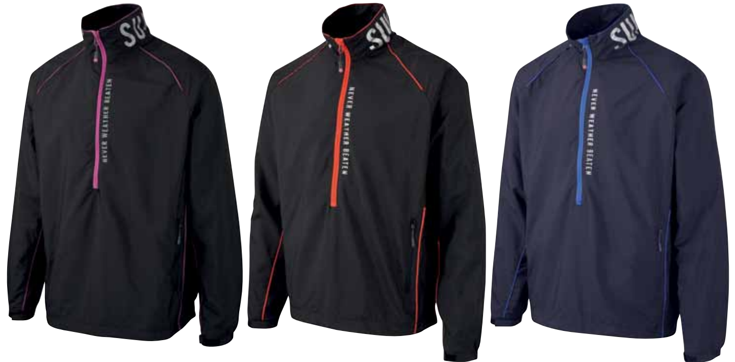
BLACK / EMPIRE