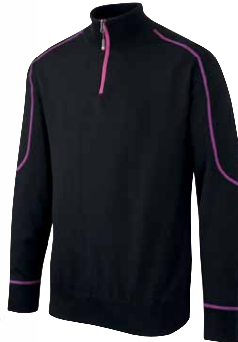
BLACK / EMPIRE/SILVER