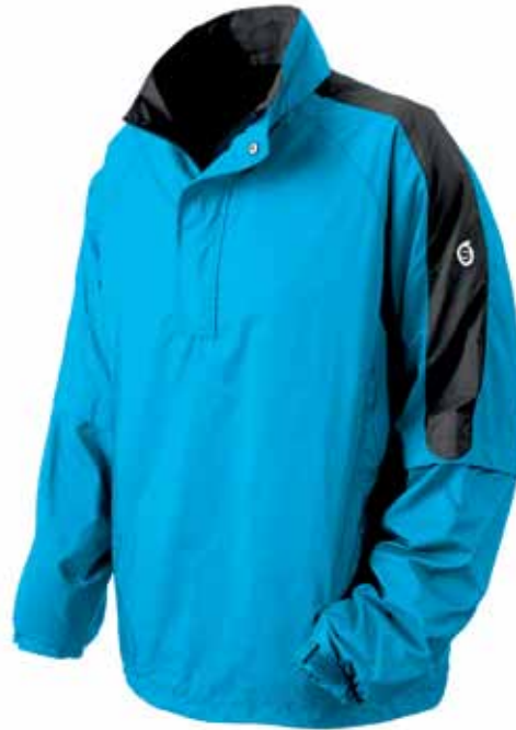
CARIBEAN / BLACK