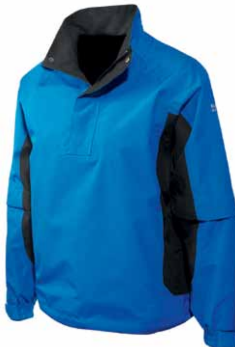
SKYDIVER BLUE / BLACK