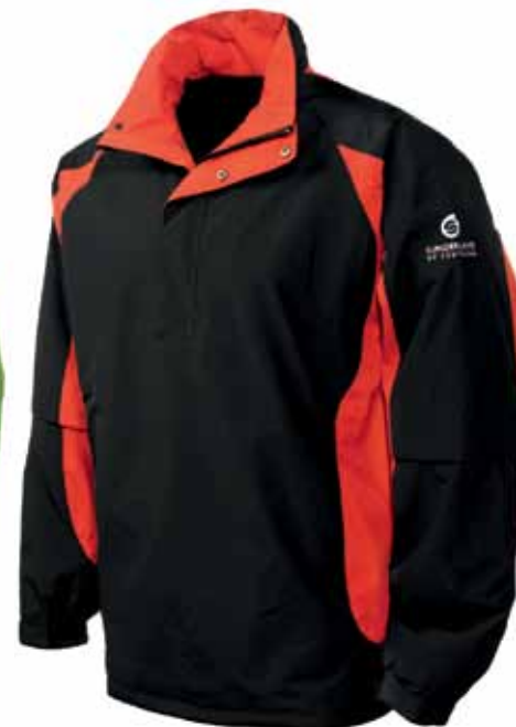
BLACK / CHILLI RED