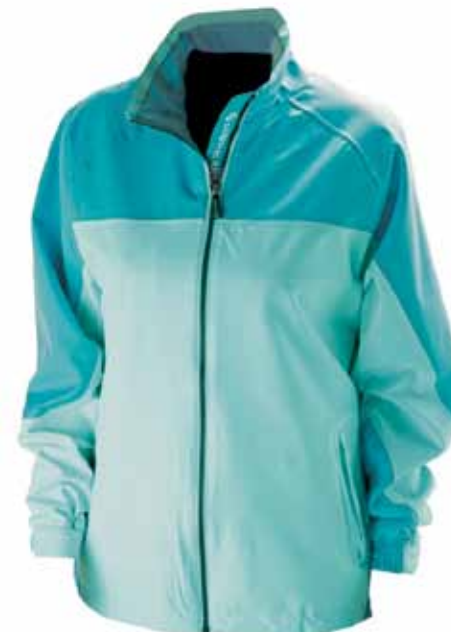
LIGHT TURQUOISE / MERMAID