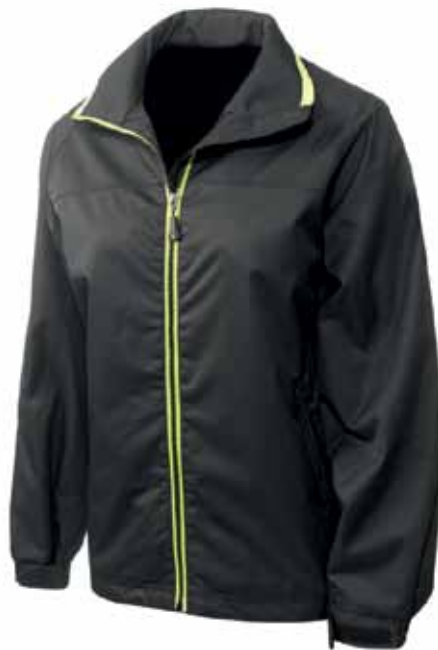
BLACK / GREEN