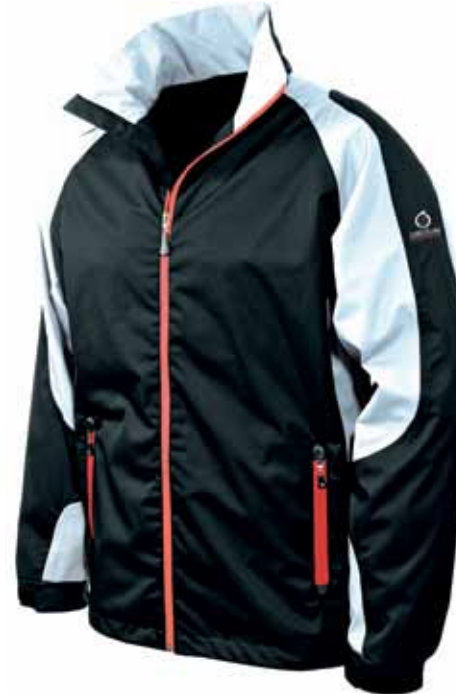
BLACK / WHITE