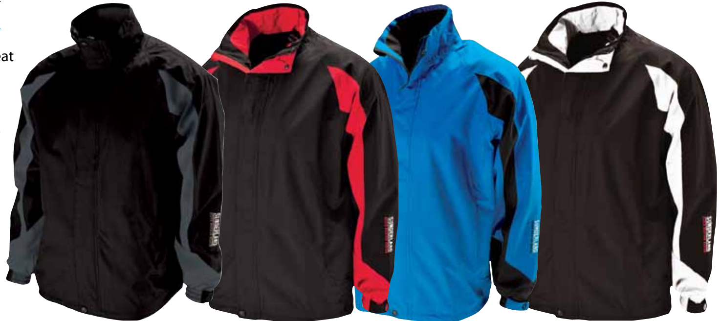
BLACK / CHARCOAL