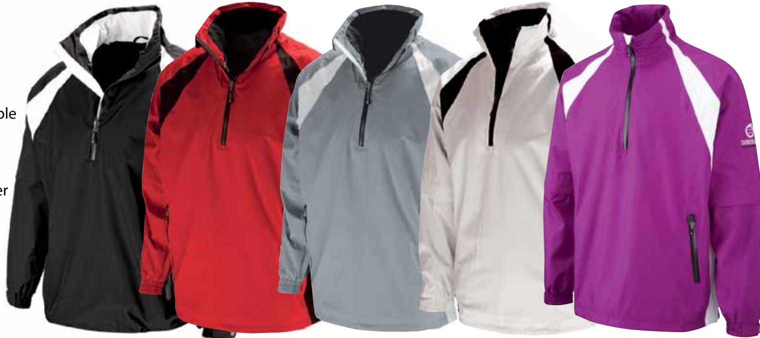
BLACK / WHITE