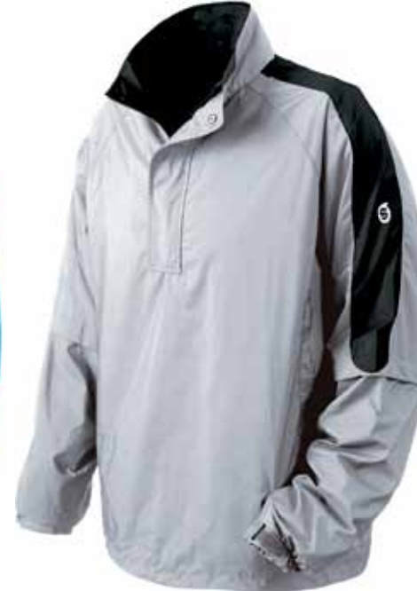
LIGHT GREY / BLACK