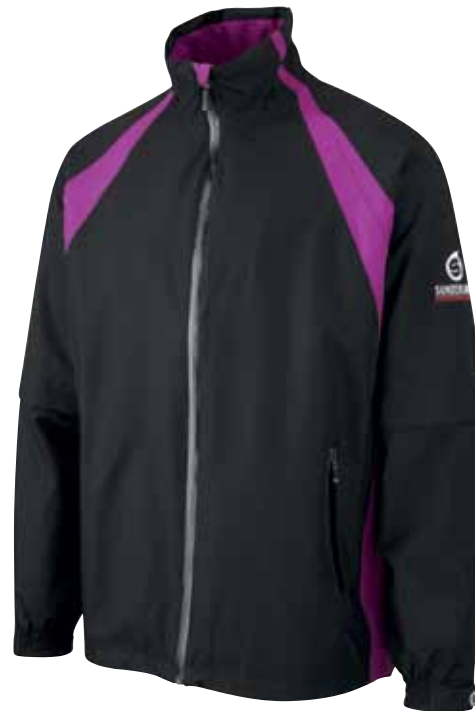
BLACK / EMPIRE