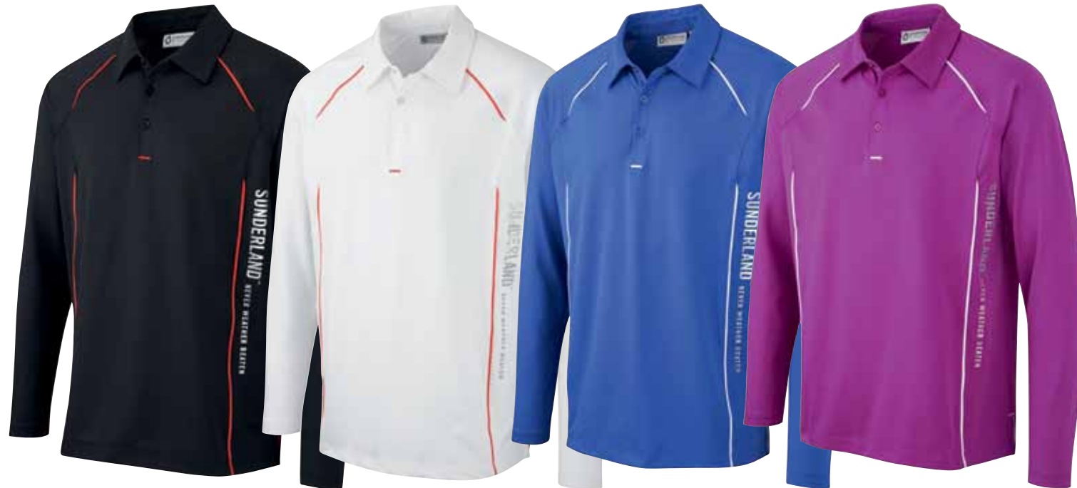
BLACK / RED

Made utilising natural technology derived from coconut shells, the Cocona™ fabric can provide up to 50 ultraviolet protection factor, depending on colour and construction. With activated carbon embedded in its yarns and fibres, Cocona™ fabric absorbs harmful UVA and UVB radiation. And because it is not a chemical treatment applied to the fabric, there are no negative effects on the skin to worry about.