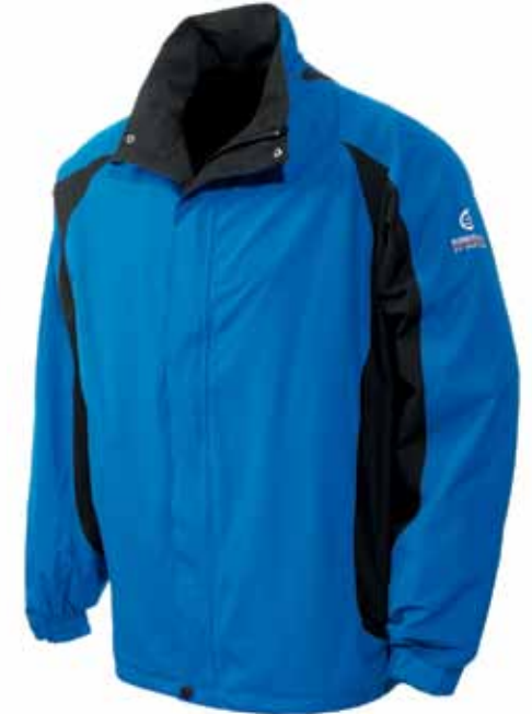
SKYDIVER BLUE / BLACK