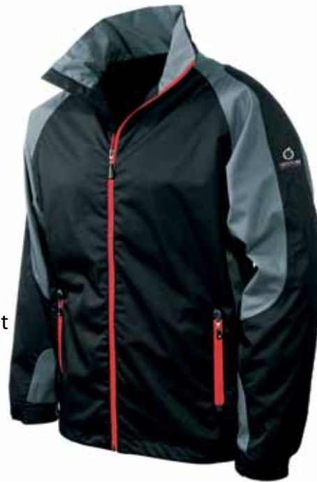
BLACK / CHARCOAL