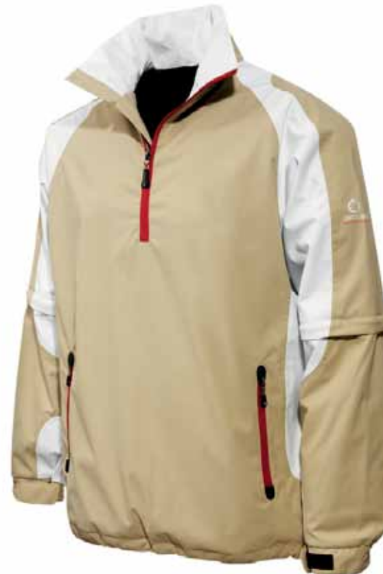
KHAKI / WHITE

THERMAL13™ High Performance Fabric helps maintain the energy balance of the human body. It uses a revolutionary technique to disperse powdered Aluminium (micron-sized particles) within the polyurethane membrane itself. This helps keep the body warm, by utilising the glint function of the metal to reflect up to 60% of body warmth, thereby reducing the conduction of thermal energy through the membrane.